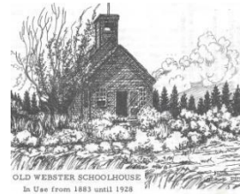
Sketch by Dede Lyons

OLD WEBSTER SCHOOL HISTORIC JAIL BASQUE OVEN MUSEUM BUILDING